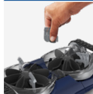
Cyclonic cleaning brushes