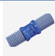
Twist Lock hose