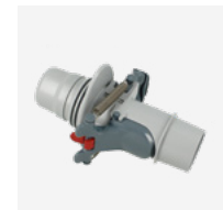
Automatic flow rate adjustment valve (skimmer)