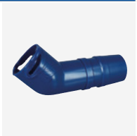
45° extended rotating elbow