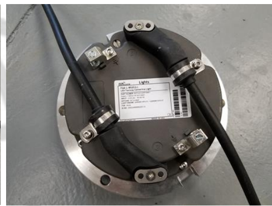
12" representative sample