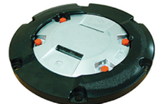
8-inch Fixture (L-850A) with snow plow ring